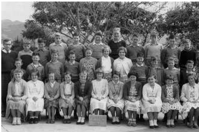
Here's the Std4 to F2 class from 1961 . It contains a few who are notable now... see if you can spot the changes.