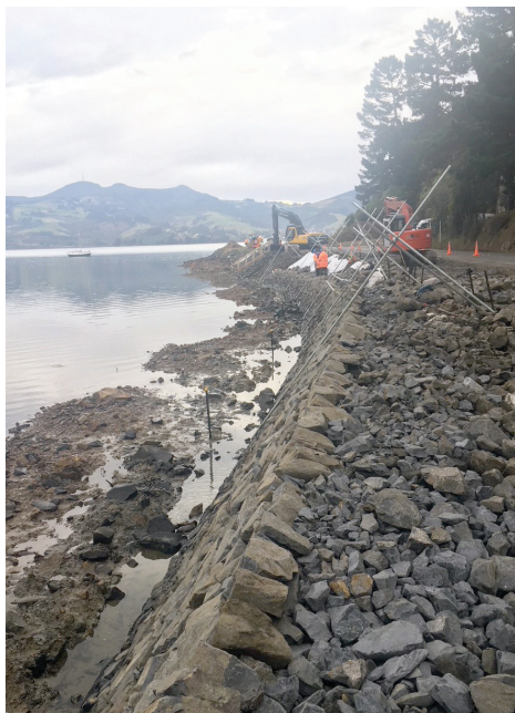
Construction of the seawall at Turnbells Bay.